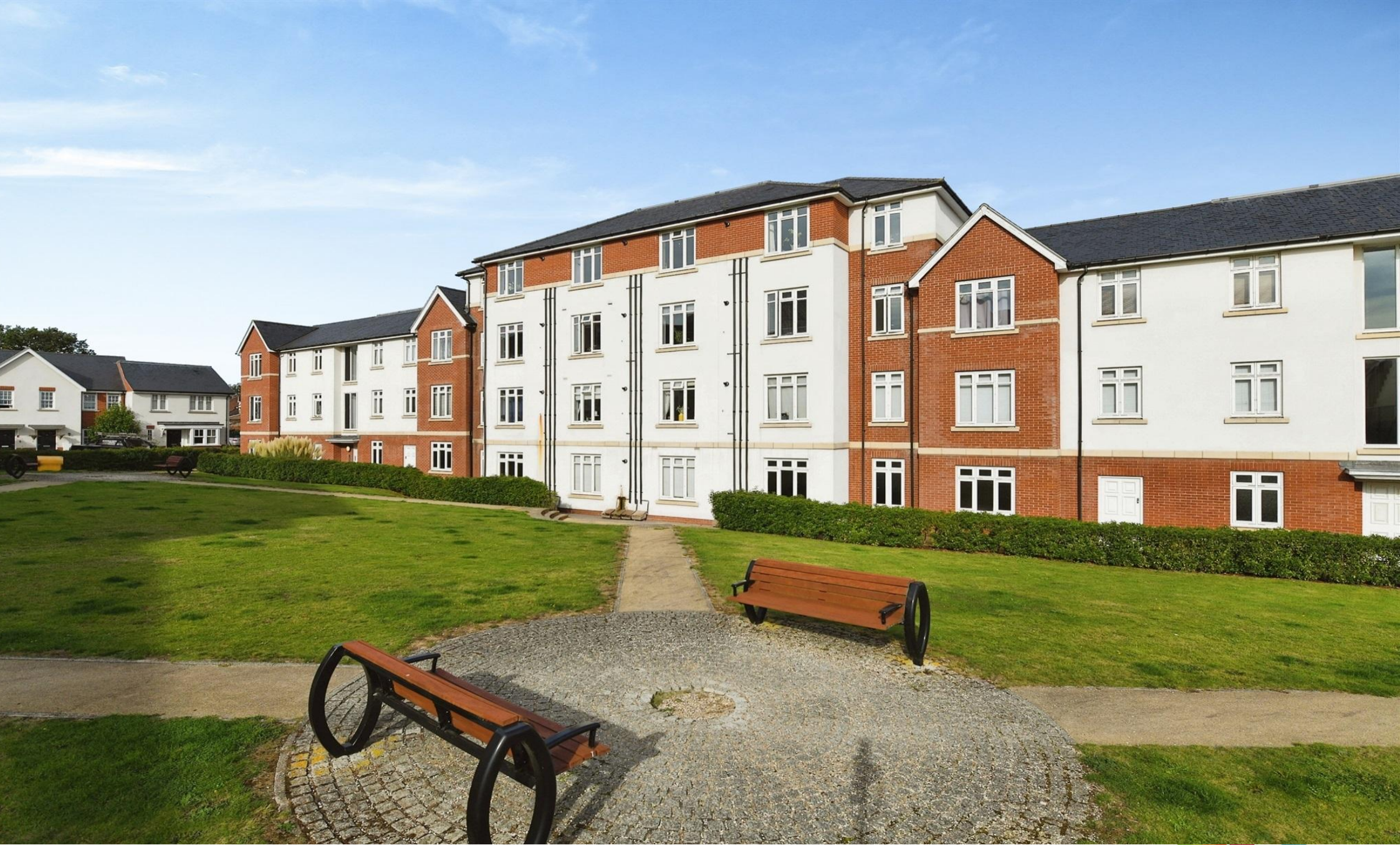
Mary Munnion Quarter, Chelmsford CM2 9FT