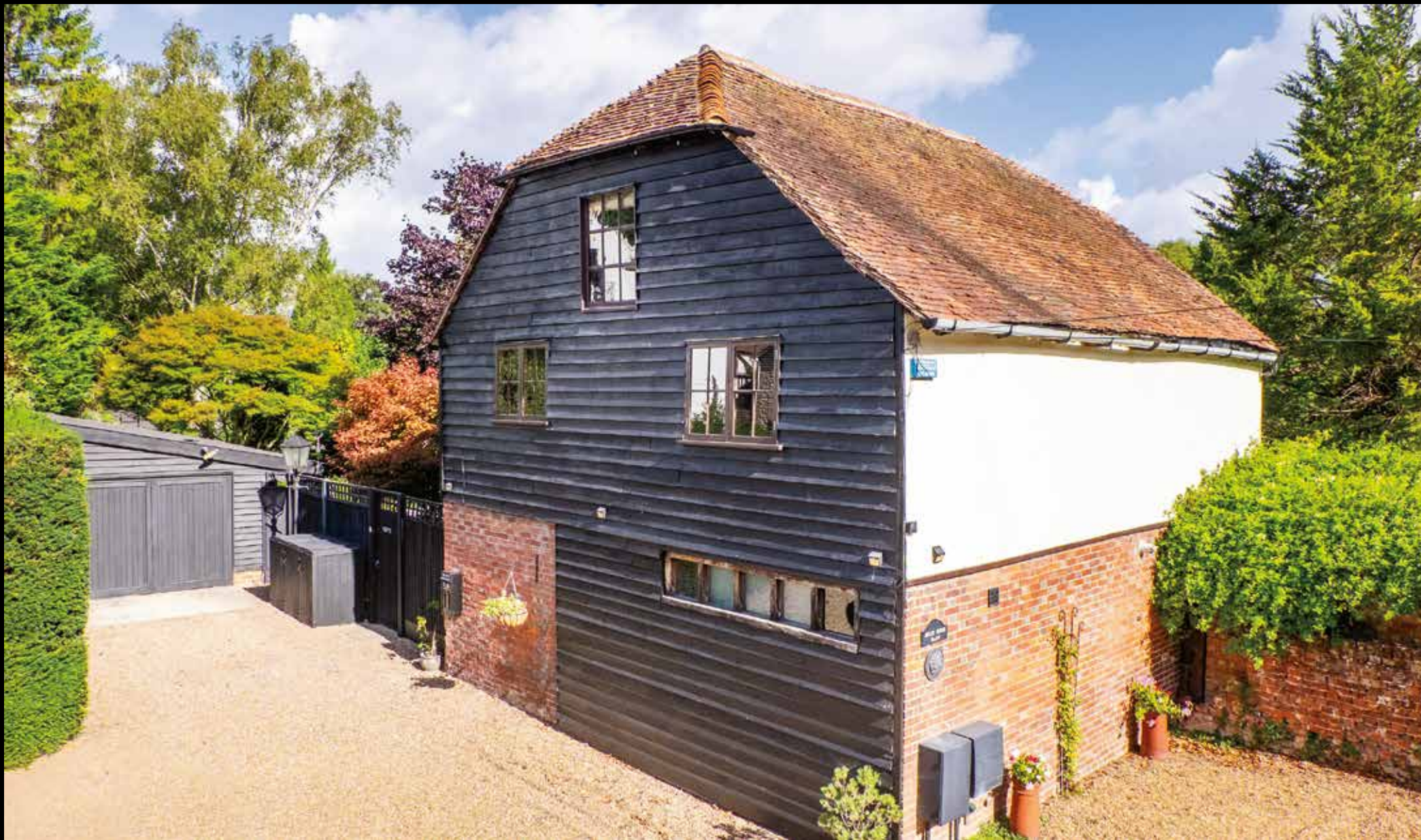
Brook House Barn Old Loose Hill | Loose | Maidstone | Kent | ME15 0BL