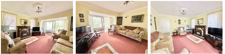
Reception Lounge 15'7" x 12'7" (4.76 x 3.84)