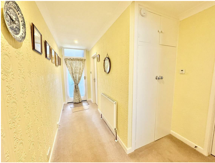
Entrance Hall 14'3" x 7'8" (4.35 x 2.34)