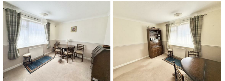
Bedroom Two 11'10" x 10'5" (3.63 x 3.19)