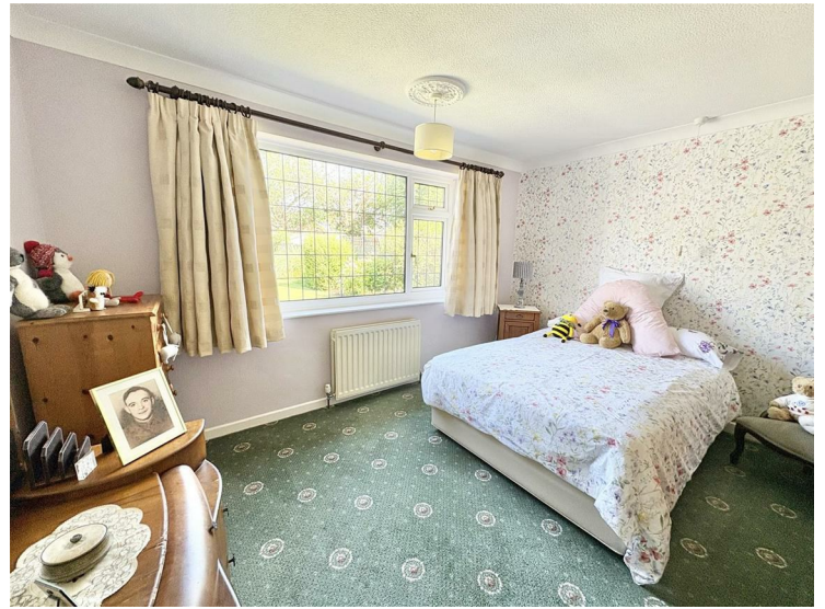
Bedroom One 13'5" x 11'3" (4.11 x 3.44)