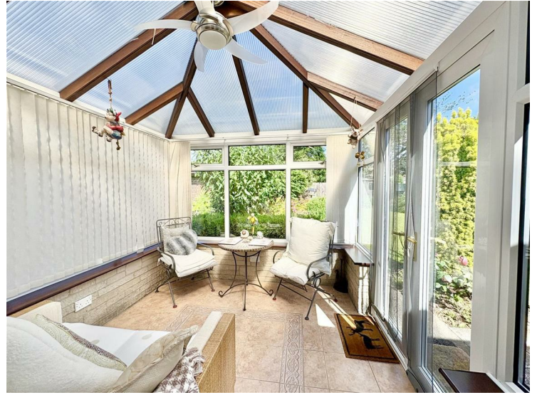
Conservatory 9'11" x 9'4" (3.04 x 2.86)