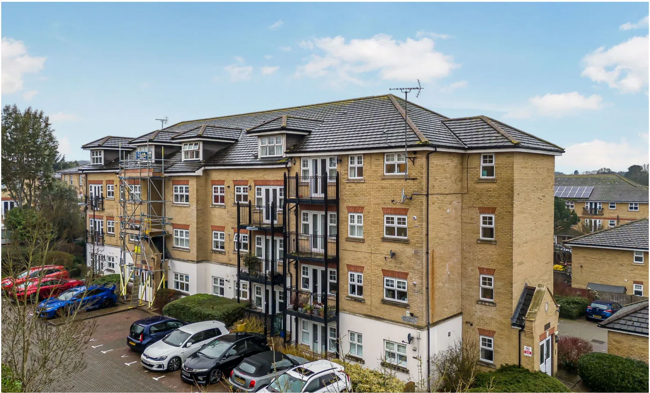
Osier Crescent, N10 London