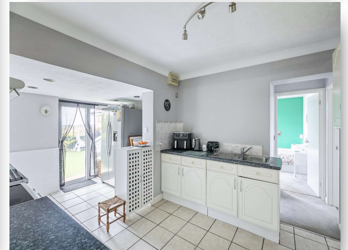
Herne Road, St Mary Ramsey Huntingdon PE26 2TB