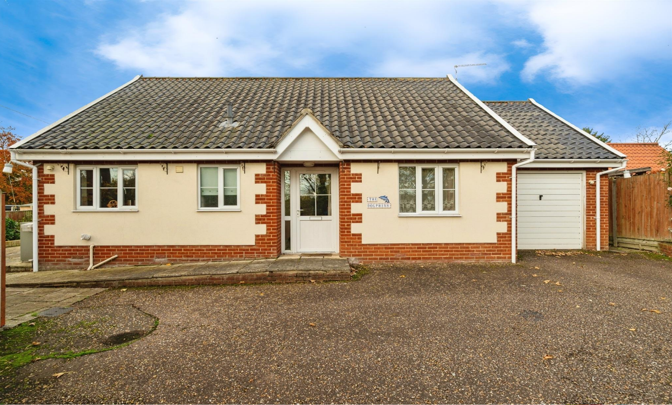
The Dolphins Winfarthing Road, Shelfanger DISS IP22 2EQ