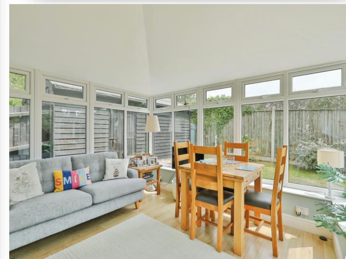
Waterworks House Bradenham Lane, Bradenham Norfolk IP25 7QR