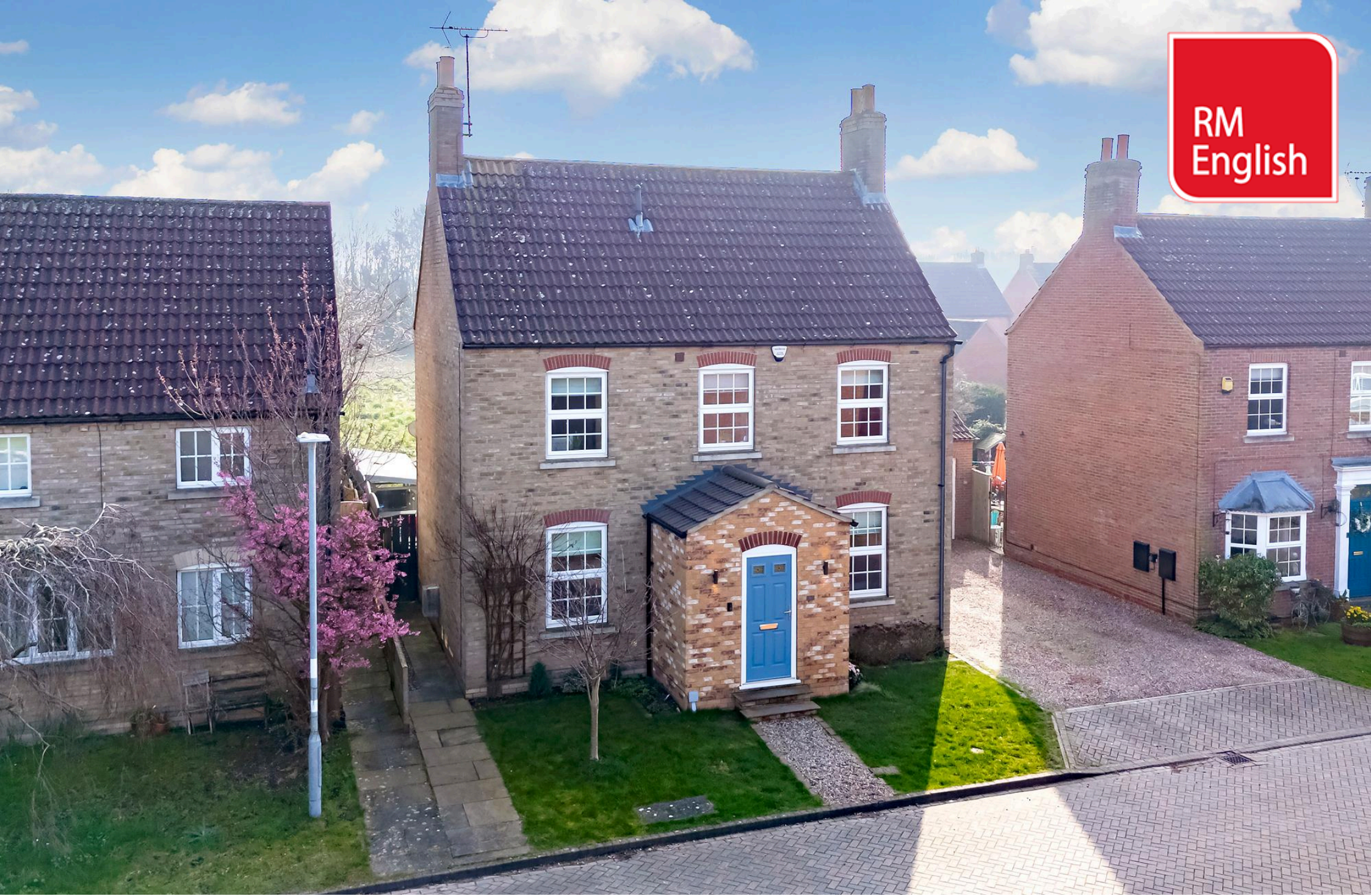
Hodsow Fields, Barmby Moor, York, East Yorkshire, YO42 4ER