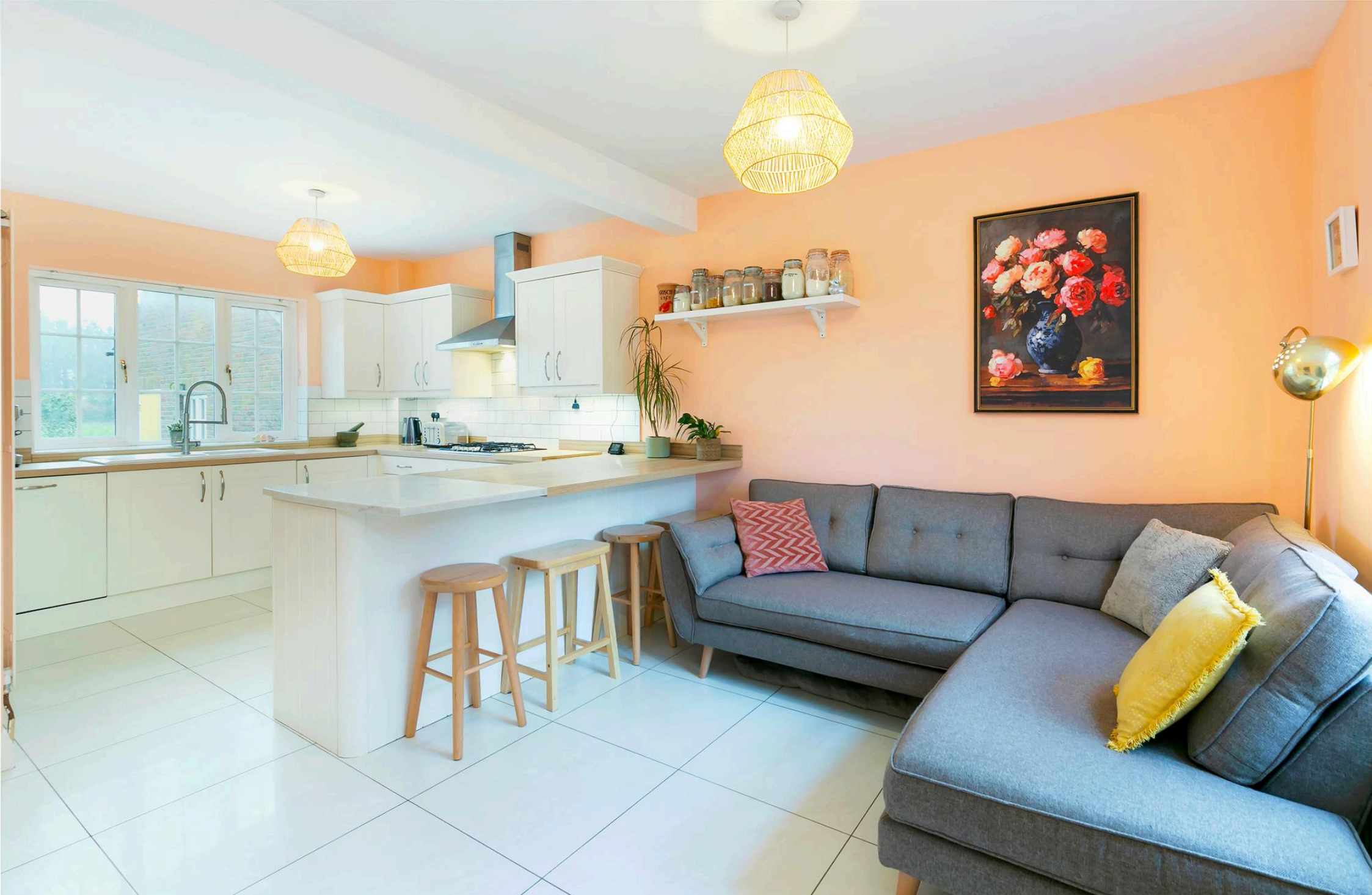
BEAUTIFULLY PRESENTED DETACHED FAMILY HOME