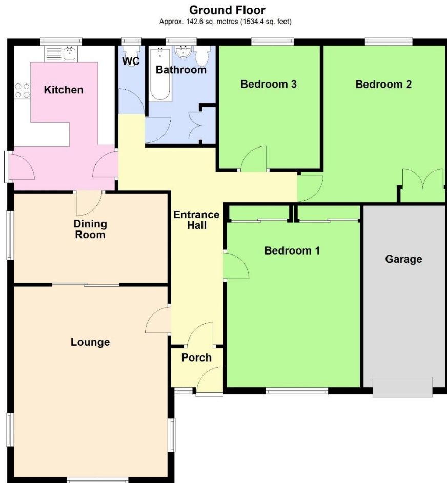
Total area: approx. 142.6 sq. metres (1534.4 sq. feet)