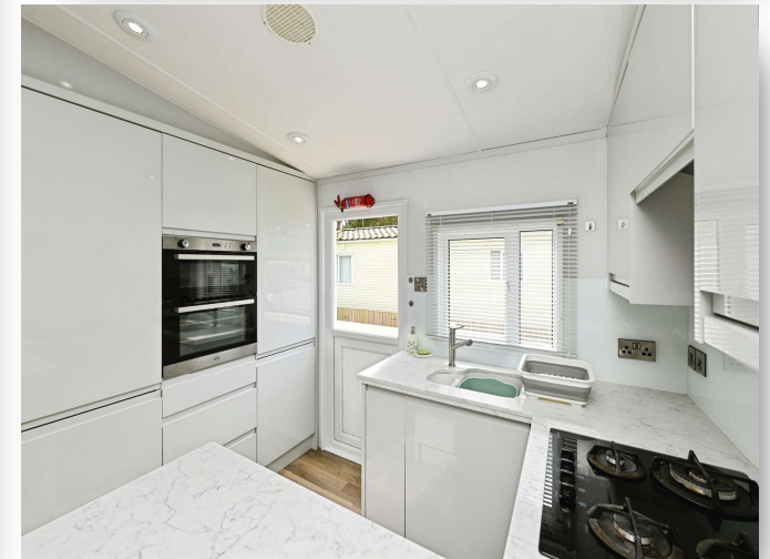
Pine Cones Caravan & Camping, Dersingham Bypass, PE31 6WL