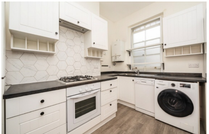
Edith Villas, W14