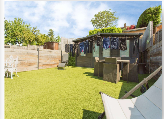
Leaders Way, Newmarket, CB8 0DP