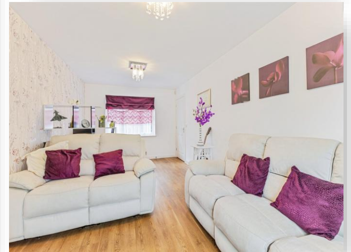
Einstein Crescent, Duston, Northampton NN5 6FY