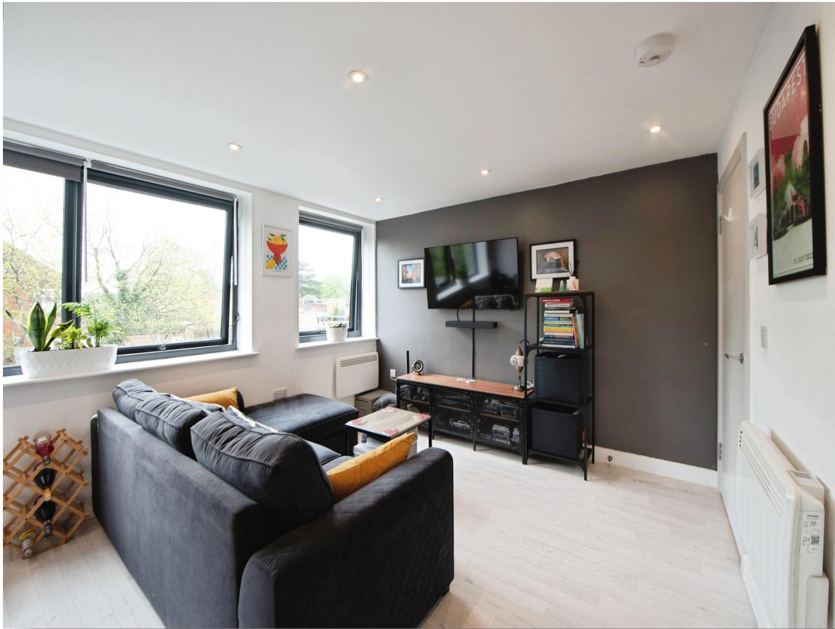
Willow Park, Havant PO9 2GG