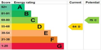
The graph shows this property's current and potential energy rating.

Consumer Protection from Unfair Regulations 2008: The Agents has not tested any apparatus, equipment, fixtures and fittings, or services, so cannot verify that they are in working order or fit for the purpose. The buyer is advised to obtain verification from his or her Professional Buyer. References to the Tenure of the property are based on information supplied by the Vendor. The agents have not had sight of the title documents. The buyer is advised to obtain verification from their Solicitor. You are advised to check the availability of any property before travelling any distance to view.