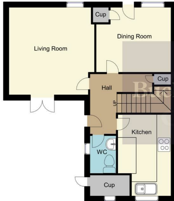
Ground Floor 46sq.m/499.98sq.ft Approx