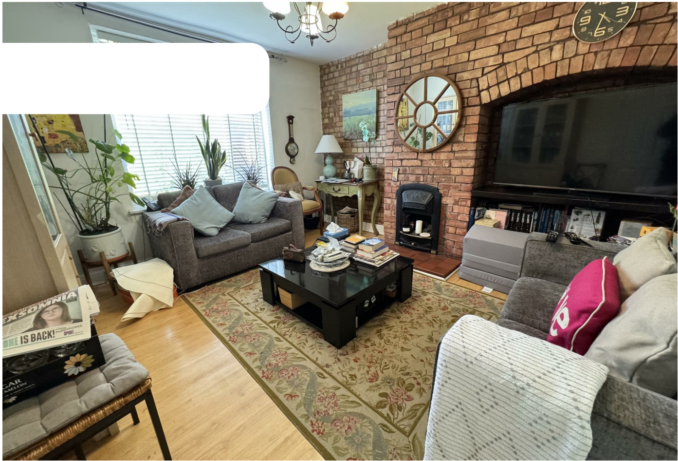
House - Terraced