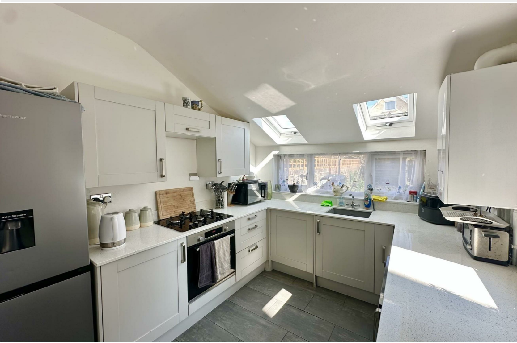
Flat 1, 9 Linden Road, Bexhill-On-Sea, TN40 1DN