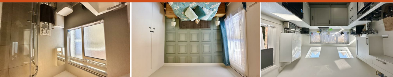
Flat 1, 9 Linden Road, Bexhill-On-Sea, TN40 1DN