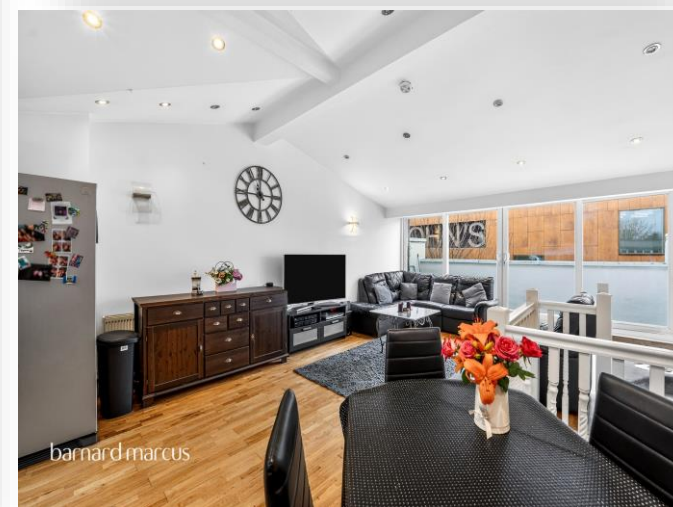
St. John's Hill, London SW11 1TH