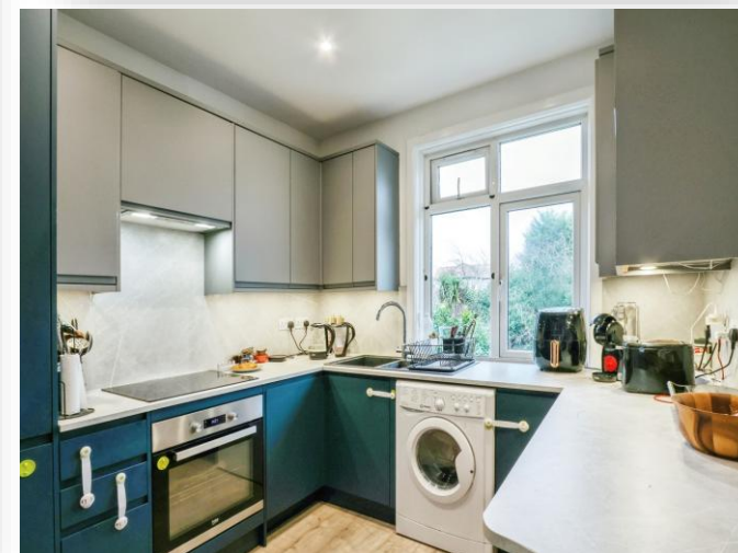
Draycott Road, Bournemouth BH10 5AP