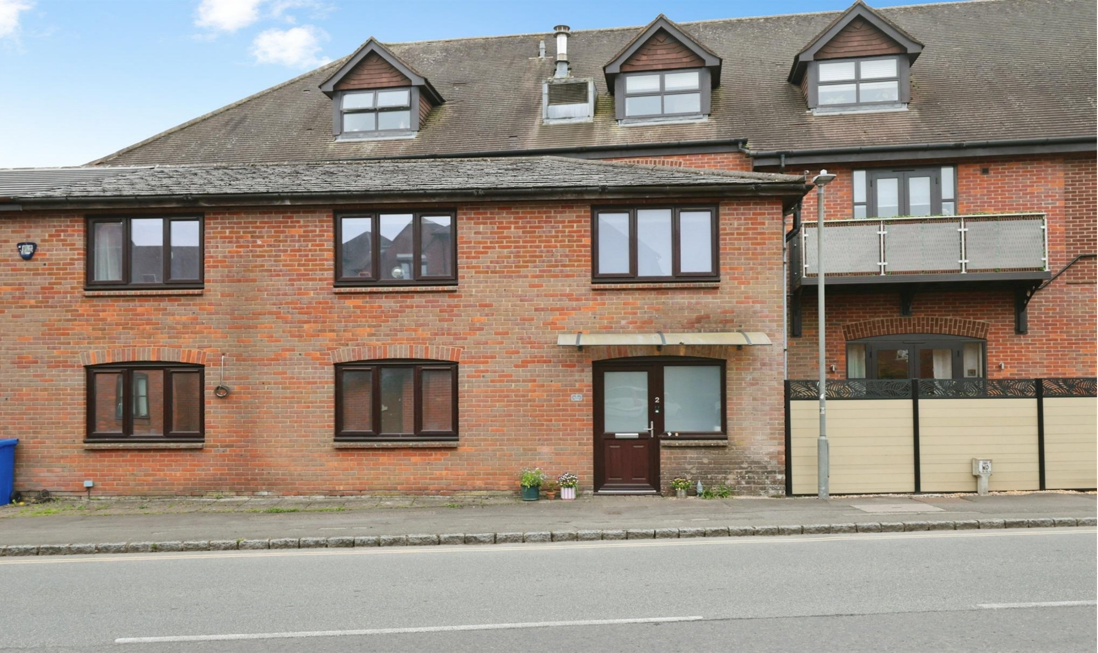
Weylands Court, Watermeadow, Chesham HP5 1LF