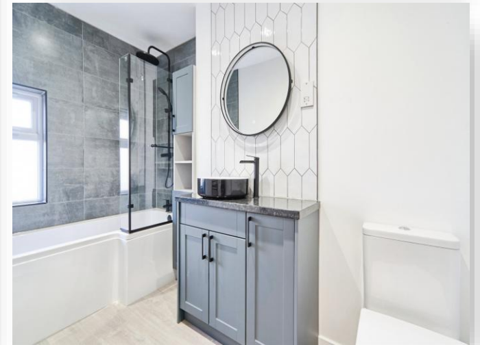
Inghams Avenue, Pudsey LS28 7PG