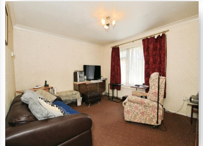
Sheepwalk, Peterborough PE4 7BL