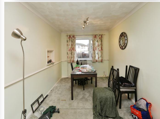
Mitchell Drive, Fair Oak, Eastleigh. SO50 7FU