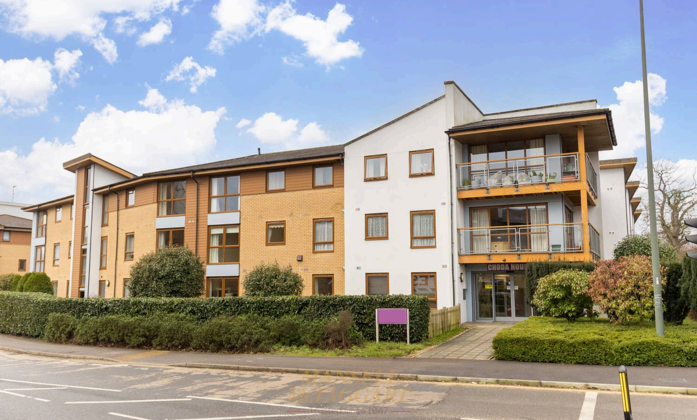
Choda House, Commonwealth Drive, Three Bridges £140,000

MANSELL McTAGGART — Trusted since 1947 —