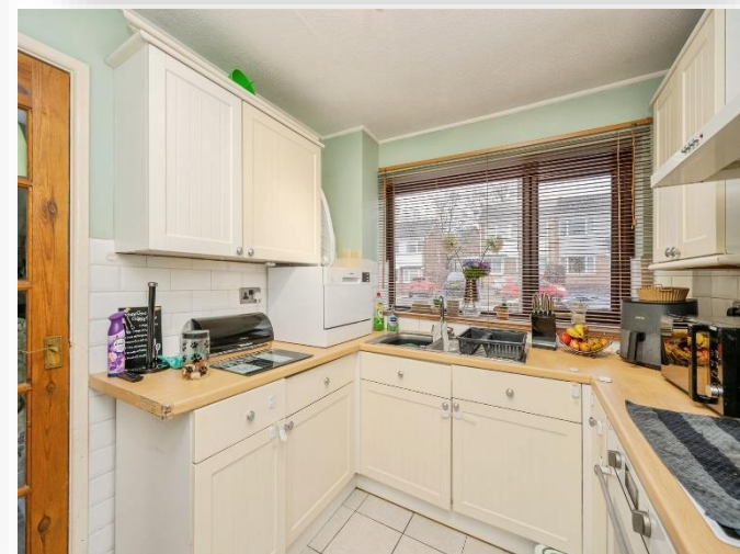
Marlborough Way, Uttoxeter ST14 7HL