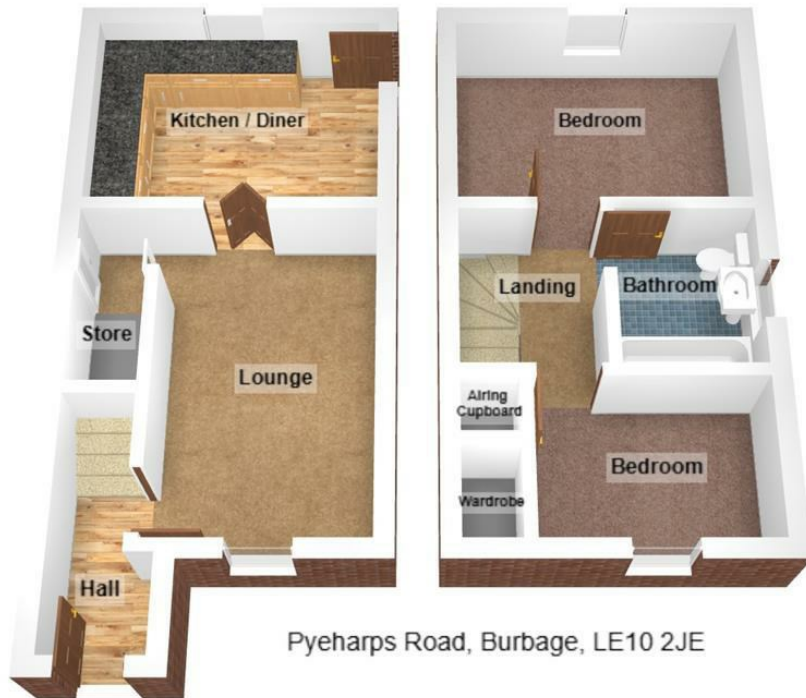
Pyeharps Road, Burbage, LE10 2JE