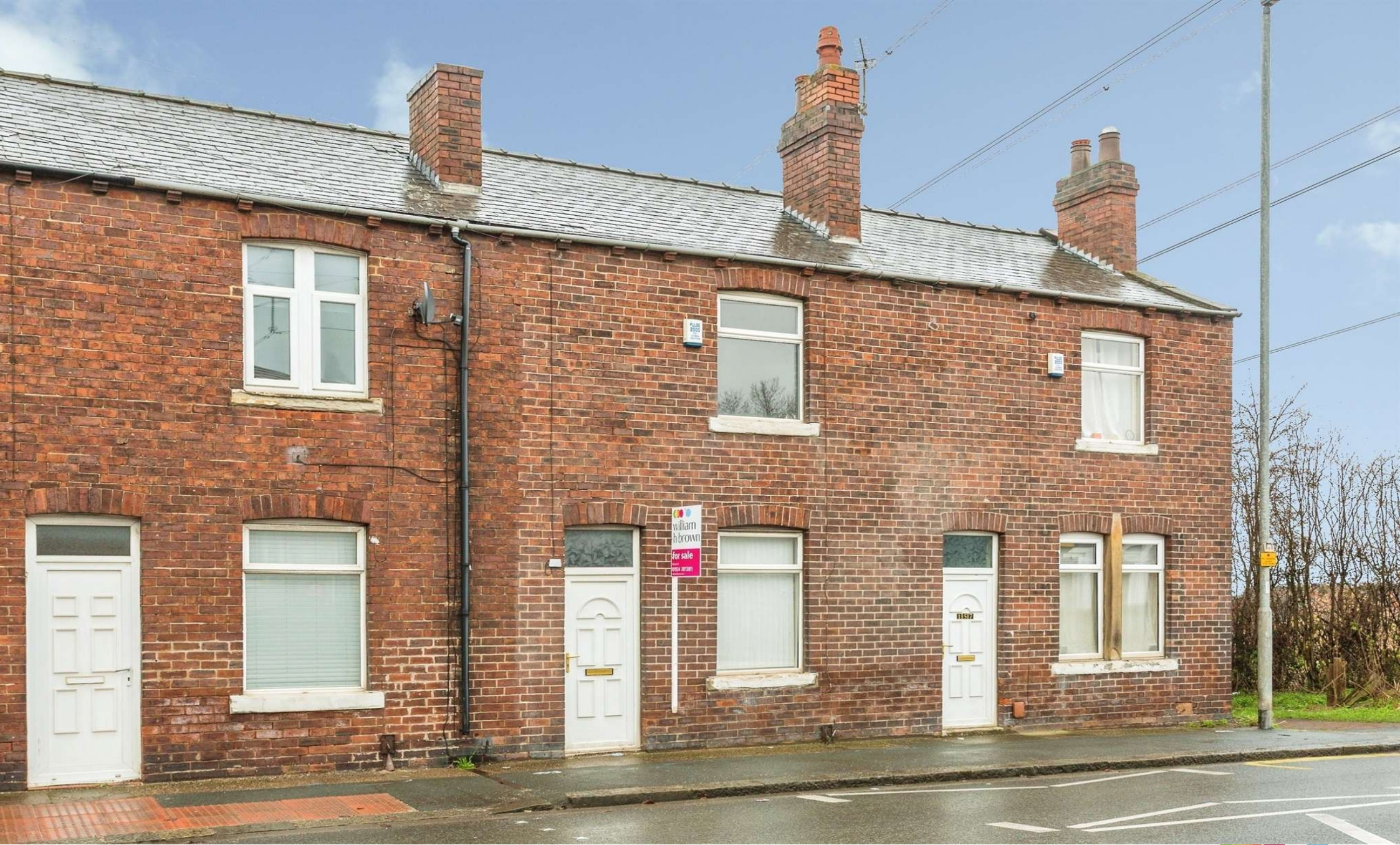
Wakefield Road, OSSETT WF5 9AD