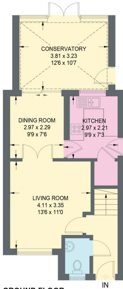
GROUND FLOOR 50.1 SQ M / 539 SQ FT