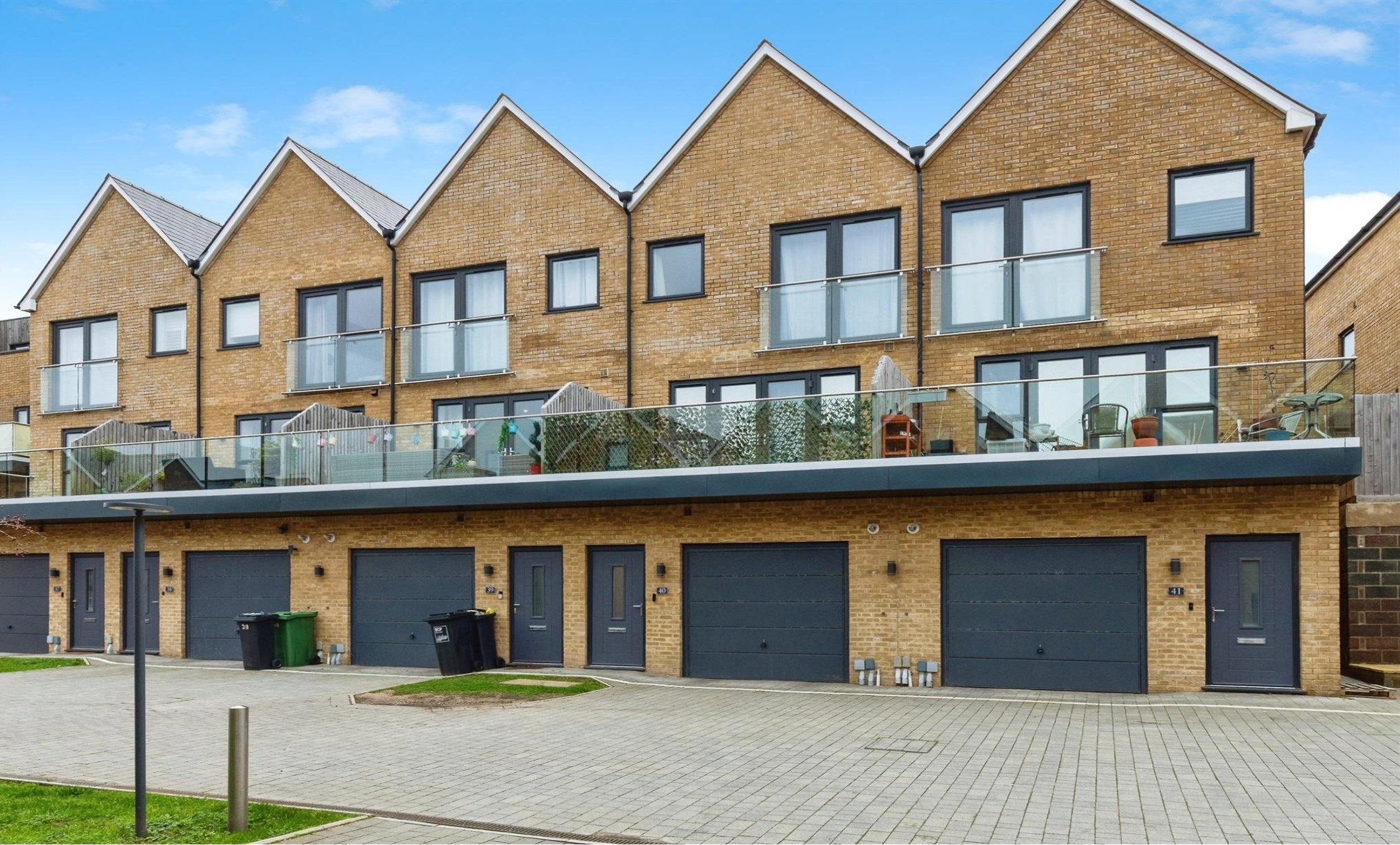
The Linen Quarter Castle Road, Bournemouth BH9 1PH