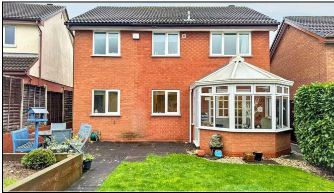
Glenfield Close, Sutton Coldfield, B76 1LD