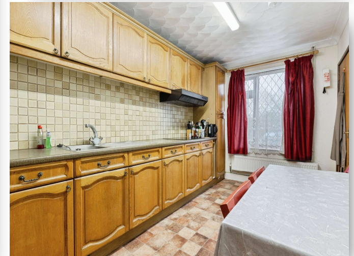
Lovelace Road, Norwich NR4 7AE