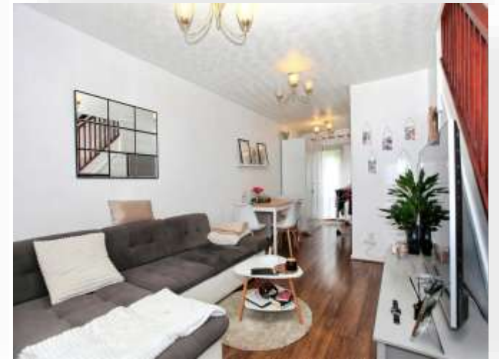
Stagshaw Drive, Peterborough PE2 8NG