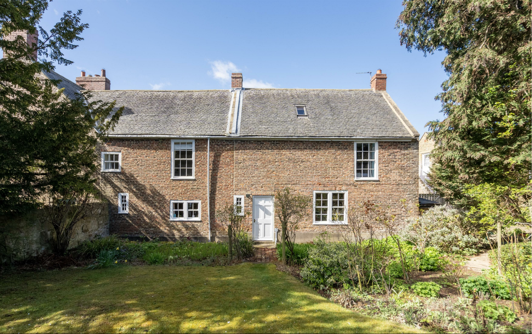
📍 Ulgham Grange Farm Cottages, Morpeth NE61 3AU