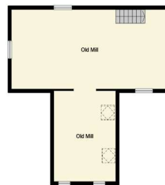
Outbuilding First Floor

This floor plan is for illustrative purposes only. It is not drawn to scale. Any measurements, floor areas (including any total floor area), openings and orientation are approximate. No details are guaranteed, they cannot be relied upon for any purpose and they do not form part of any agreement. No liability is taken for any error, omission or misstatement. A party must rely upon its own inspection(s). Powered by www.focalagent.com