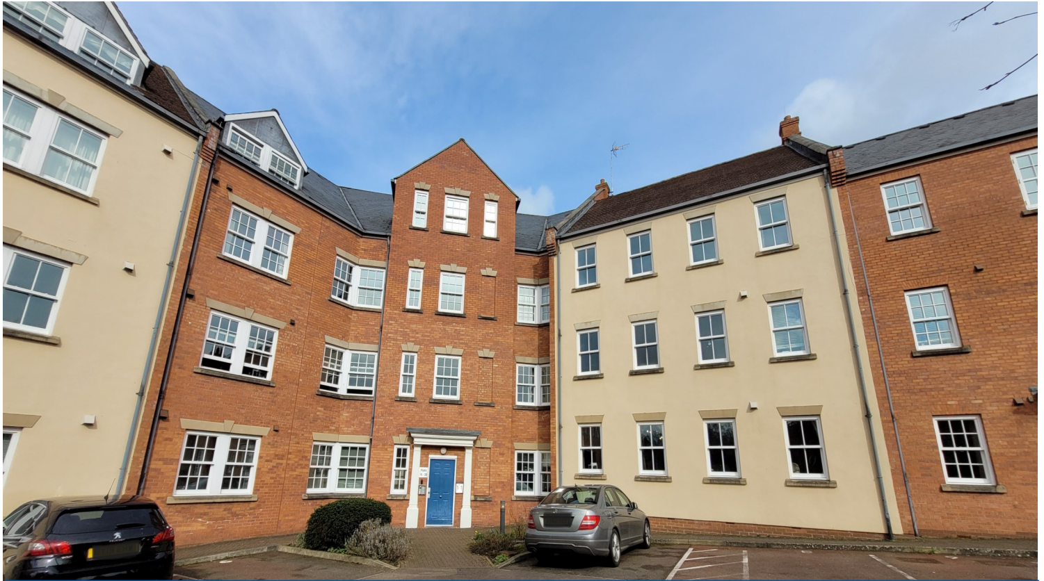
PEOPLES PLACE, BANBURY, OXON, OX16 0FJ

Telephone: 01295 275909 • Email: info@steppingstonesletting.com