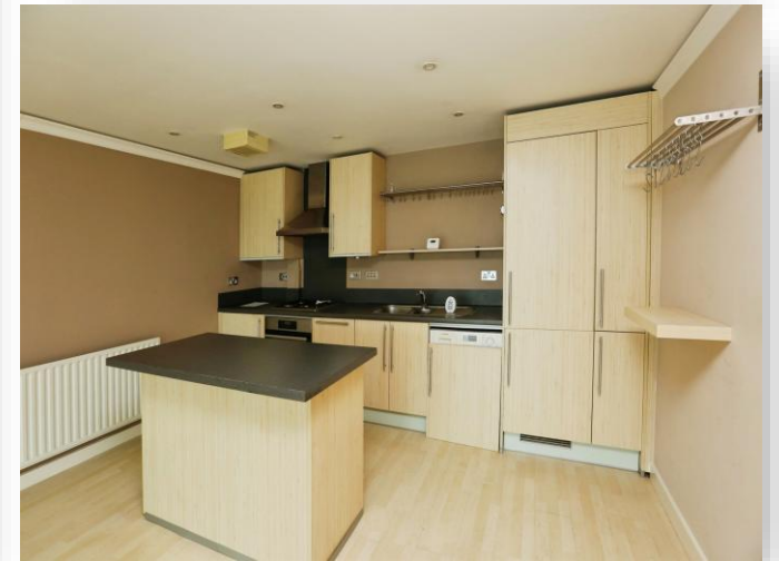
The Quarterdeck, Gosport Marina, Mumby Road, Gosport, PO12 1AL