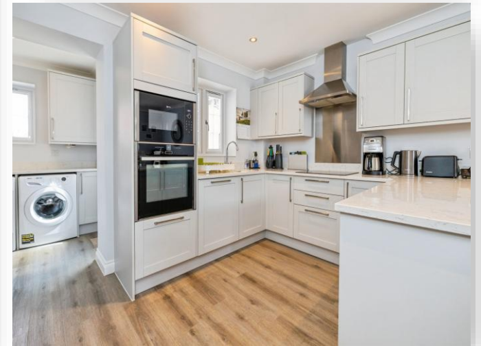
Rowan Avenue, Saxilby Lincoln LN1 4AE