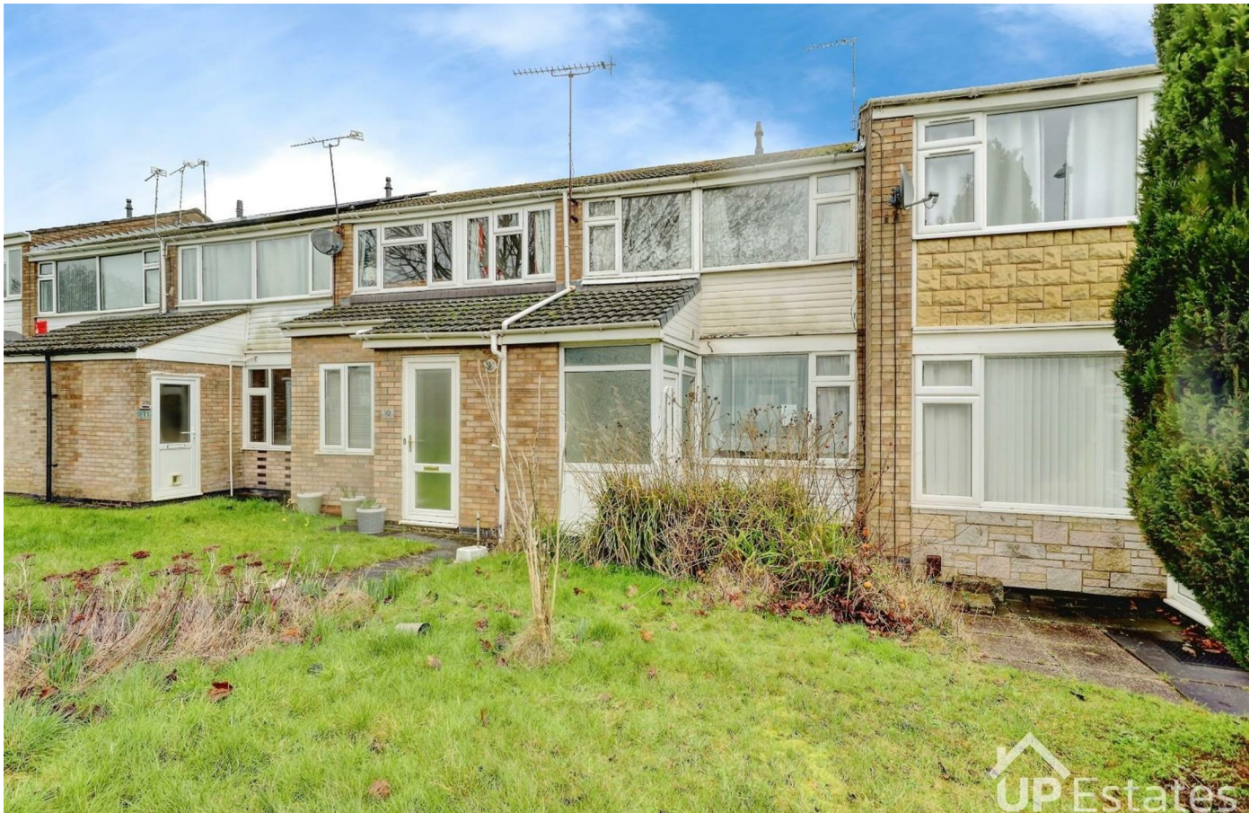
Somerly Close, Binley, Coventry