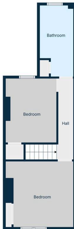
Floor Plan Created By Cubicasa App. Measurements Deemed Highly Reliable But Not Guaranteed.