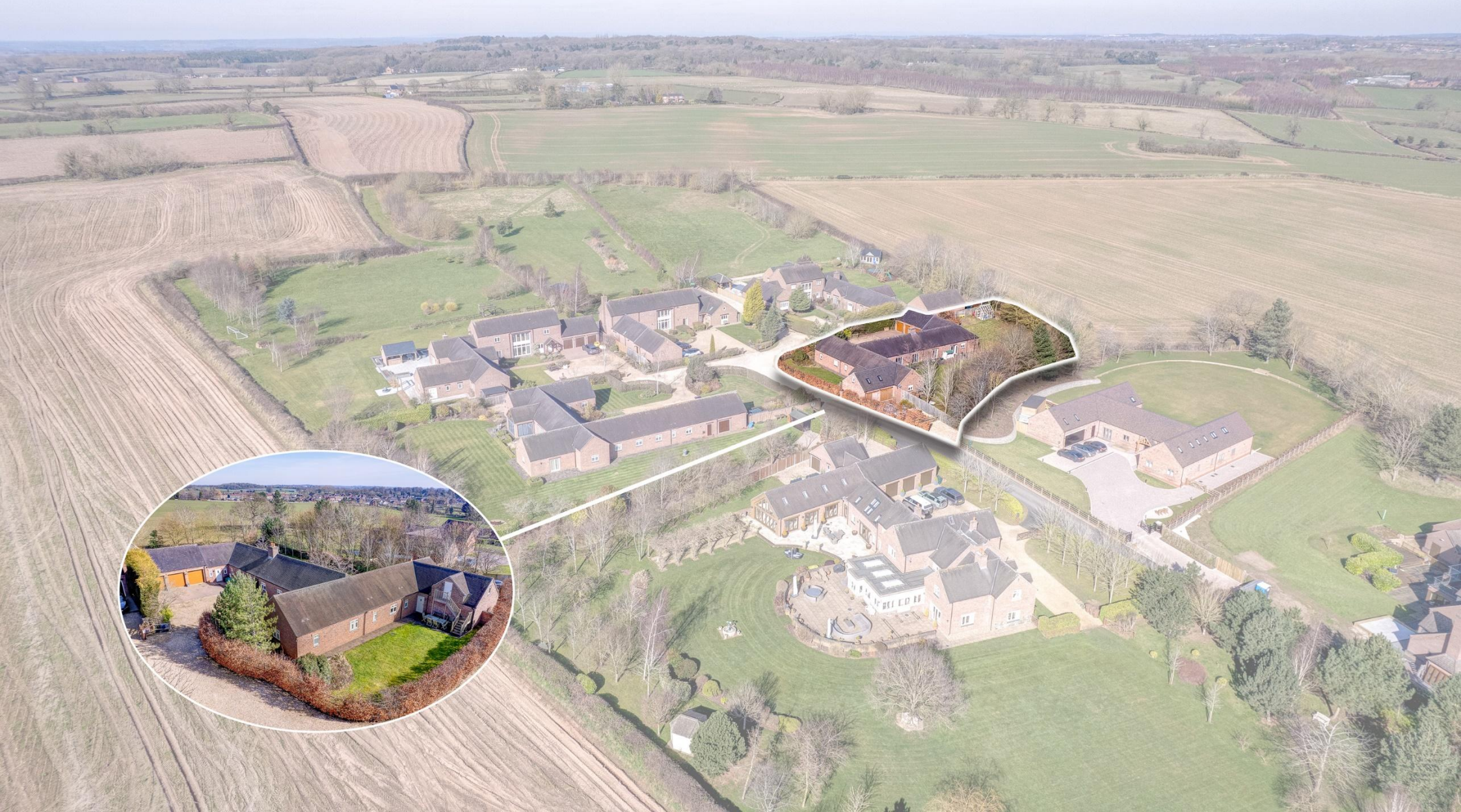
Rydeware House, 5 Woolstitch Park, Clifton Road, Netherseal, DE12 8BT