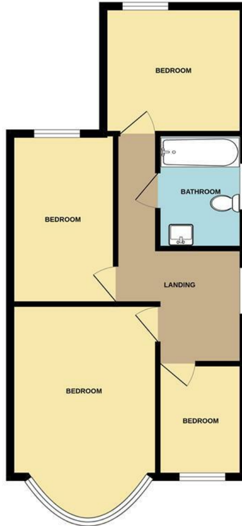
1ST FLOOR 525 sq.ft. (48.8 sq.m.) approx.