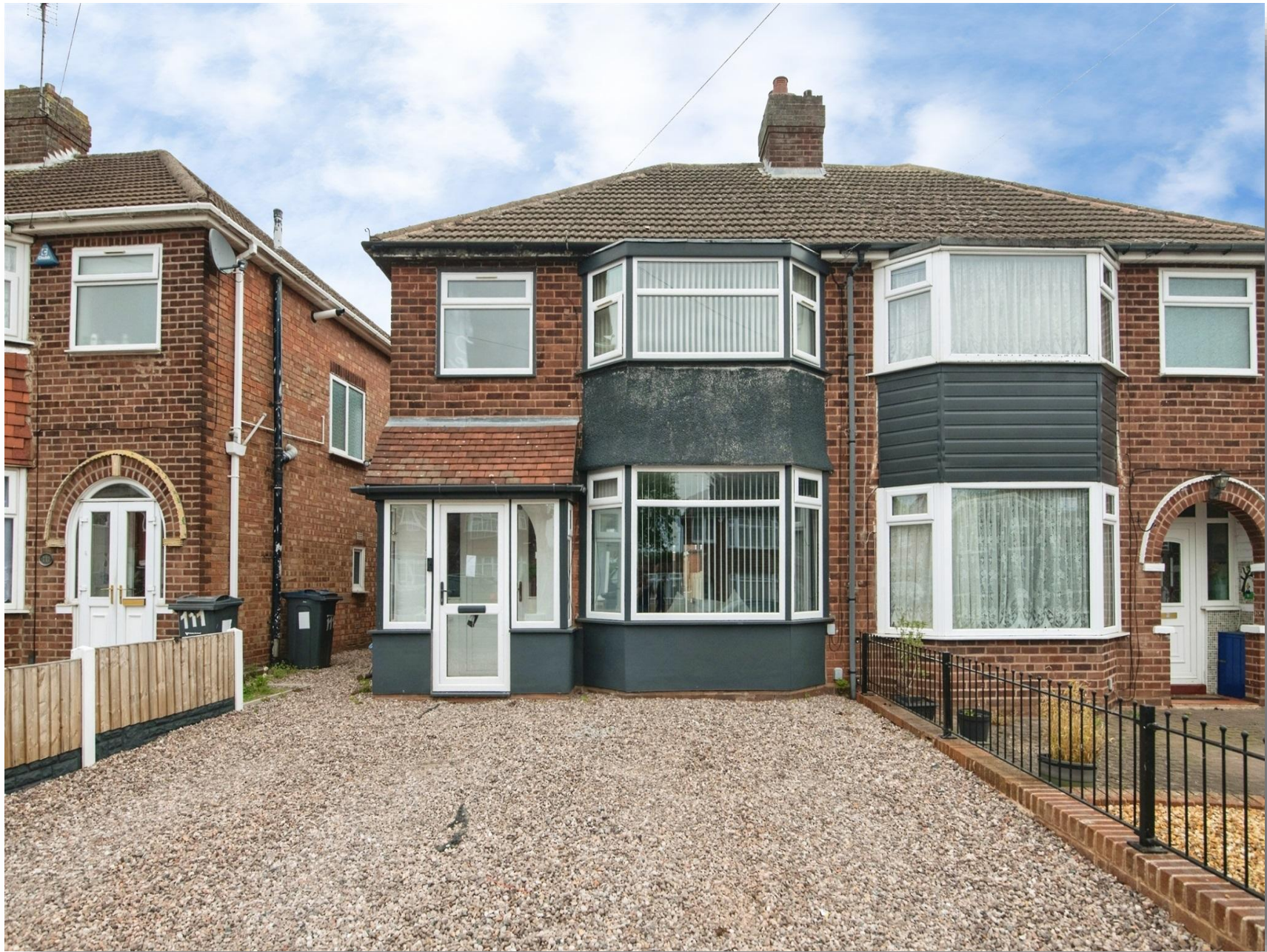
Oscott School Lane, Birmingham B44 9EN