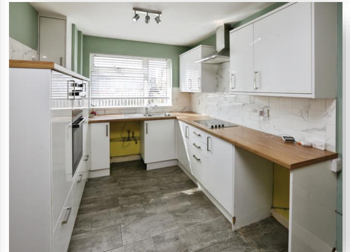
St. Vincent Road, Gosport PO12 4QW