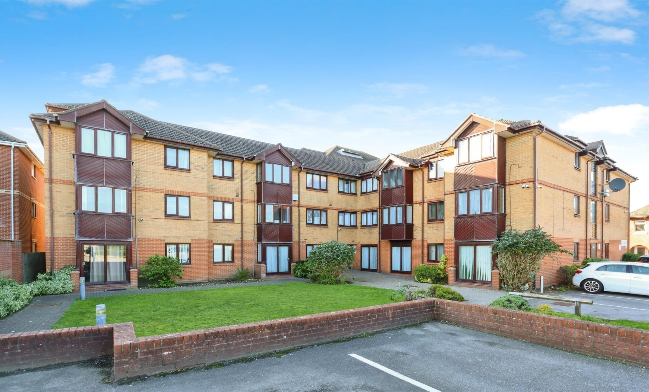
St. Clements Court Cleveland Road, Bournemouth BH1 4QJ