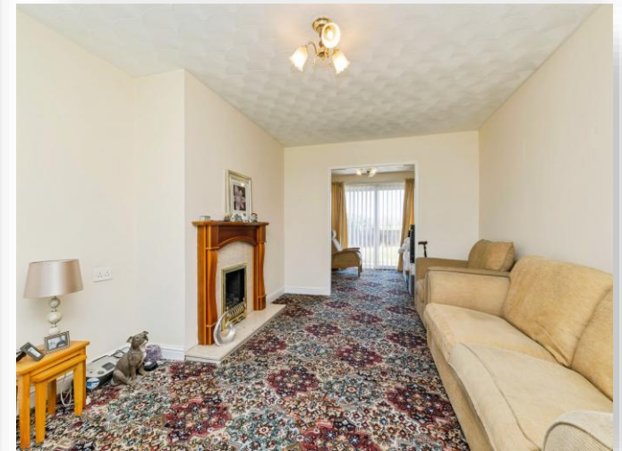
Fenton Road, Hartlepool TS25 2LQ