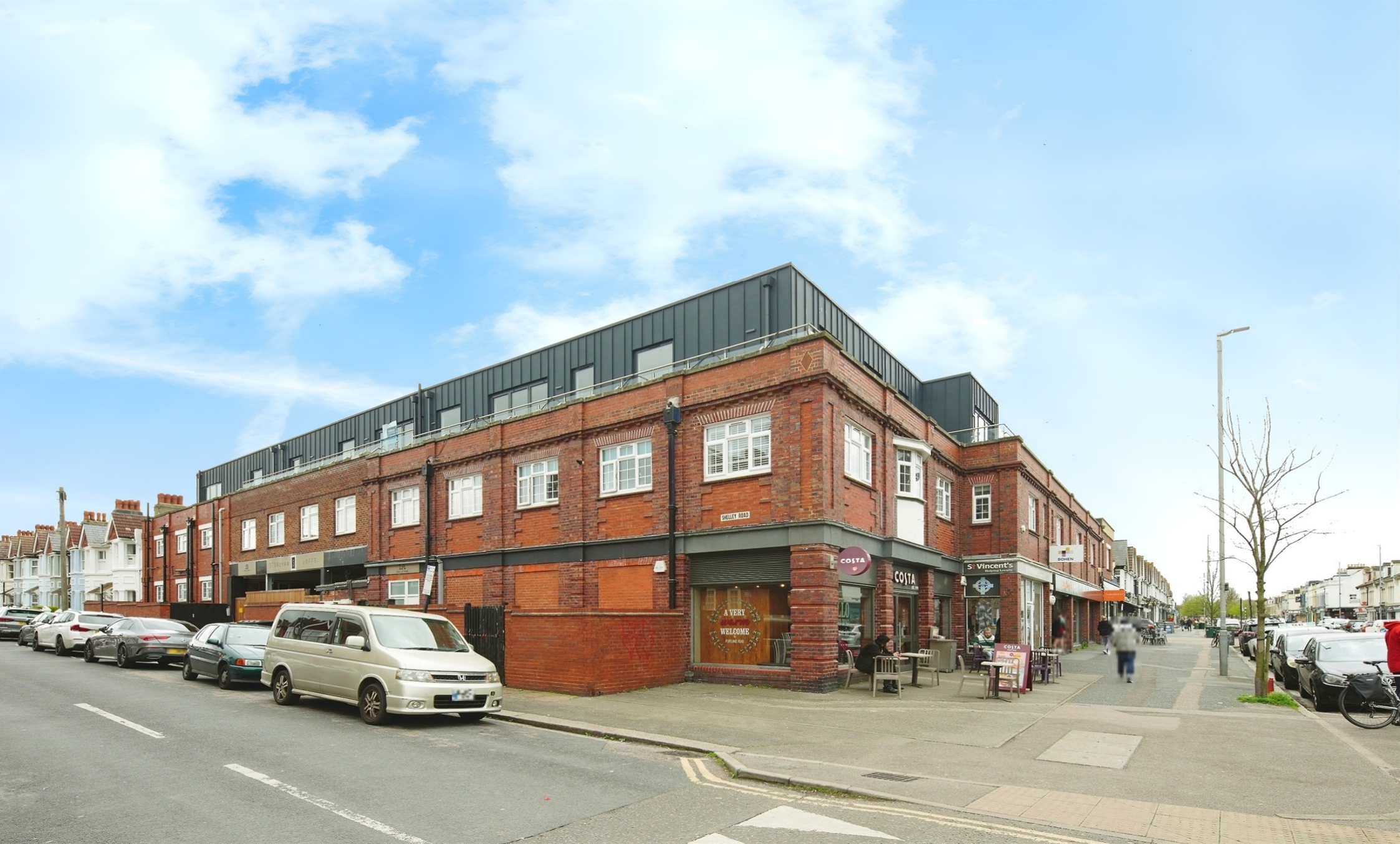
Shelley Road, Hove BN3 5FQ