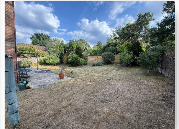
Mill Hill, Brandon, IP27 0BP