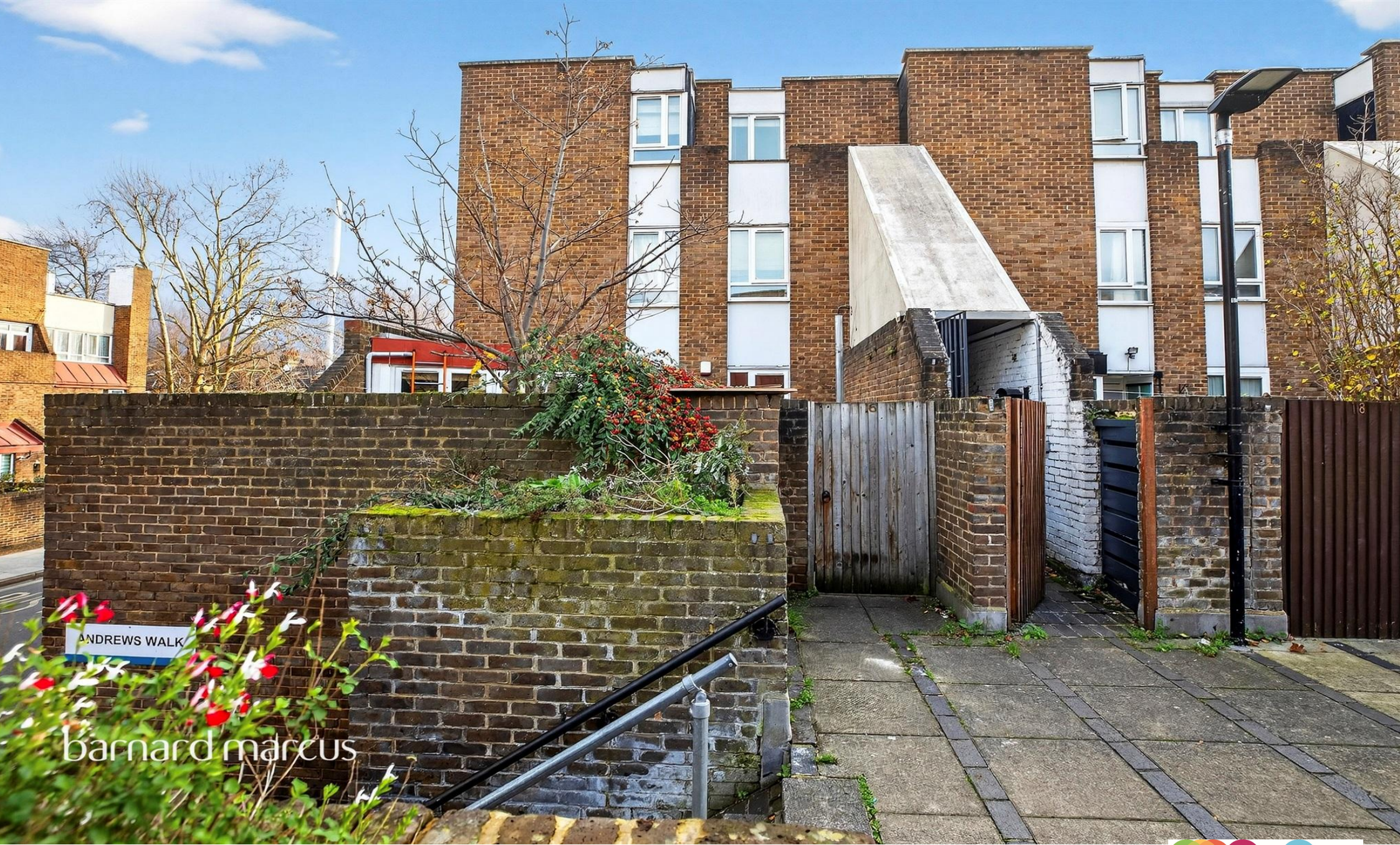
Andrews Walk, London SE17