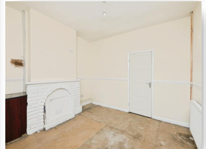
Holmes Lane, Ferham ROTHERHAM S61 1DA